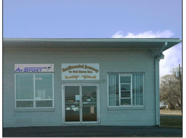
Conveniently located in the newly renovated terminal building, Hangar One, on North side of Piper Memorial Airport, Lock Haven PA.

AV SPORT OF LOCK HAVEN 353 PROCTOR STREET LOCK HAVEN PA 17745