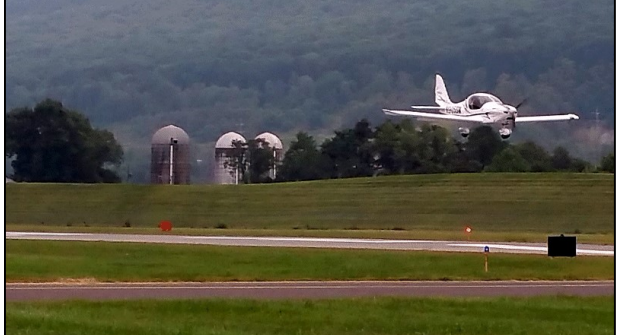
Light Sport Flight Training at the birthplace of sport aviation: Piper Memorial Airport Lock Haven PA