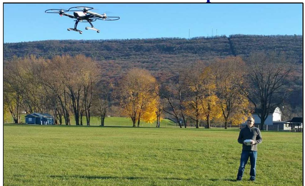
For as little as $1000 (including taxes), earn your FAA Remote Pilot Certificate with a Small Unmanned Aircraft System rating. Call to reserve your seat in our next course.